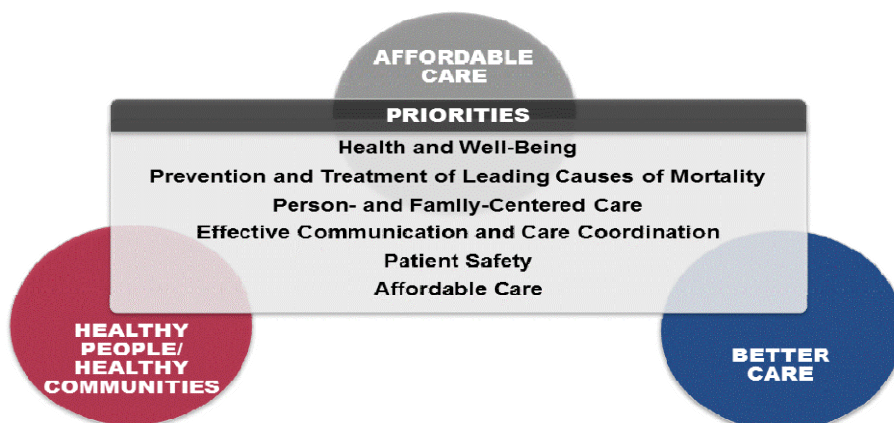
Figure 3. National Quality Strategy Priorities.

To advance the aims, the NQS focuses on six priorities, as illustrated in Figure 3 below.