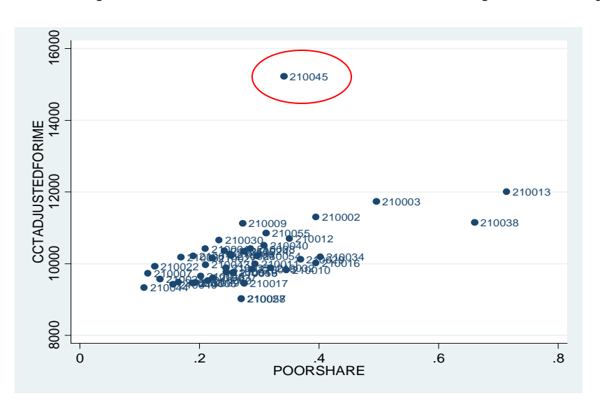
Chart 1 Regression Diagnostic for the FY 2012 ROC IME and DHS Regression Analysis

The regression diagnostic, Chart 1, determined that one hospital, McCready Memorial Hospital (210045), was significantly different than the other observations in the regression.